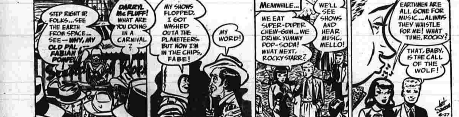
BY RUSS WINTERBOTHAM